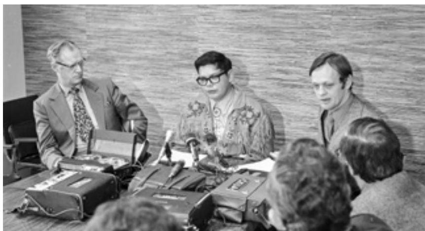
Edmonton Journal / Provincial Archives J-547

This will mean establishing a proper balance of cooperation and communication between teachers, board of directors, parents, and students. It will mean staffing the school with Native people or others who will encourage the students to realize their capabilities and the opportunities awaiting them in the modern world. 12